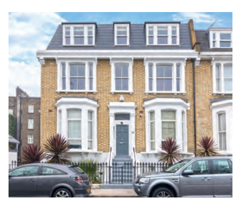
EARLS COURT GARDENS | SW5