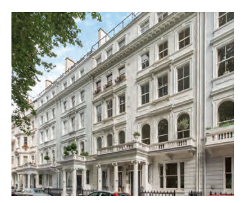
CORNWALL GARDENS | SW7 LEASEHOLD An unmodernised, raised ground floor flat on a sought after garden square with its own front door.