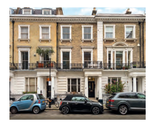
NEVILLE STREET | SW7