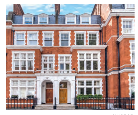
EVELYN GARDENS | SW7

A completely unmodernised Grade II listed part-stucco fronted freehold house.