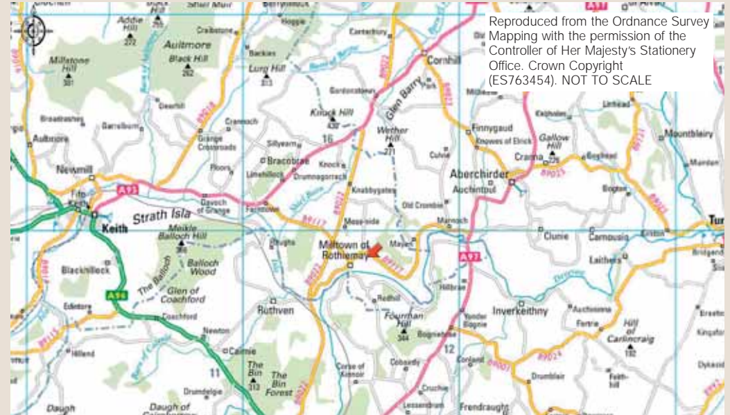
Reproduced from the Ordnance Survey Mapping with the permission of the Controller of Her Majesty's Stationery Office. Crown Copyright (ES763454). NOT TO SCALE

Banchory Office, St. Nicholas House, 68 Station Road, Banchory, AB31 5YJ banchory@struttandparker.com www.struttandparker.com