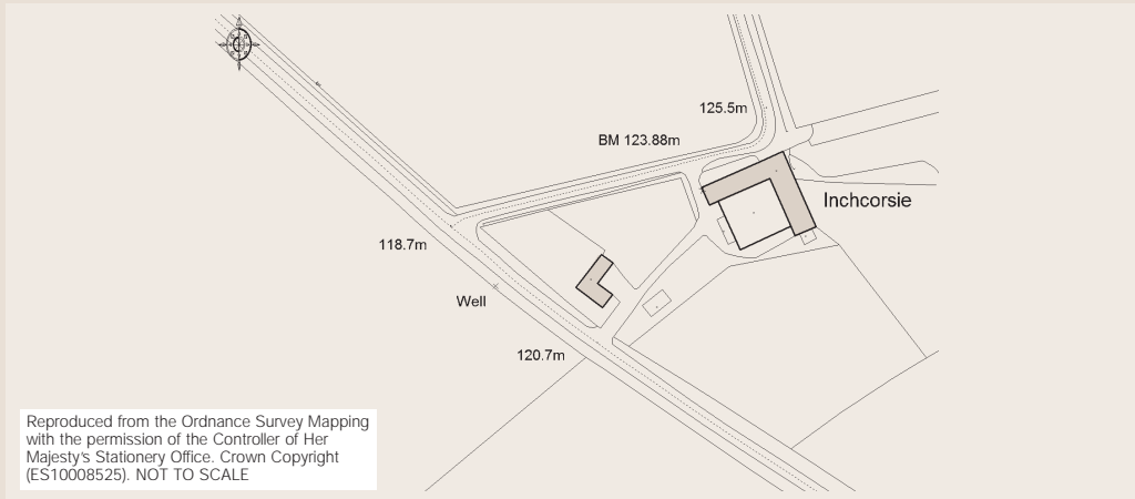
Reproduced from the Ordnance Survey Mapping with the permission of the Controller of Her Majesty's Stationery Office. Crown Copyright (ES10008525). NOT TO SCALE