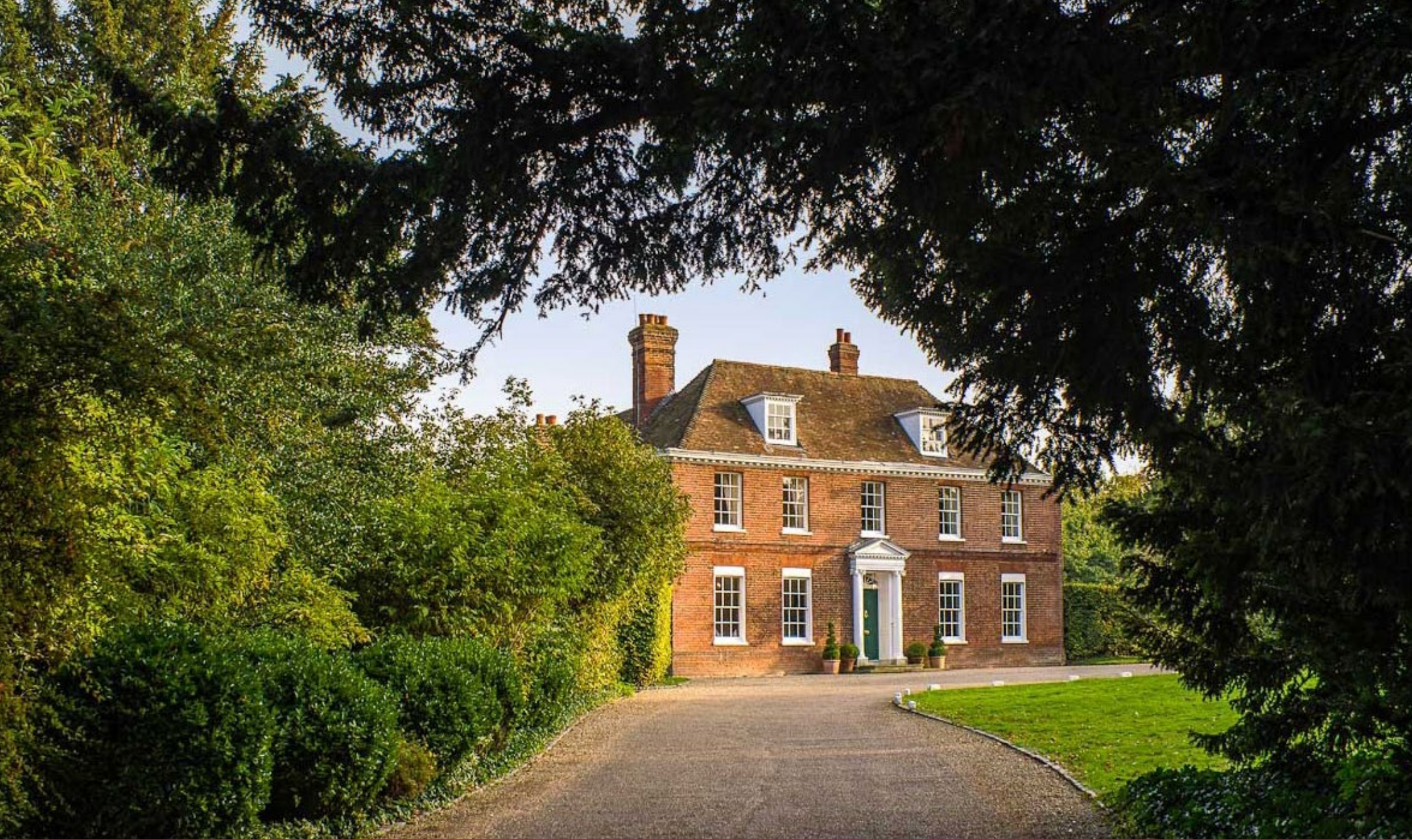
Macknade Manor, Faversham, Kent