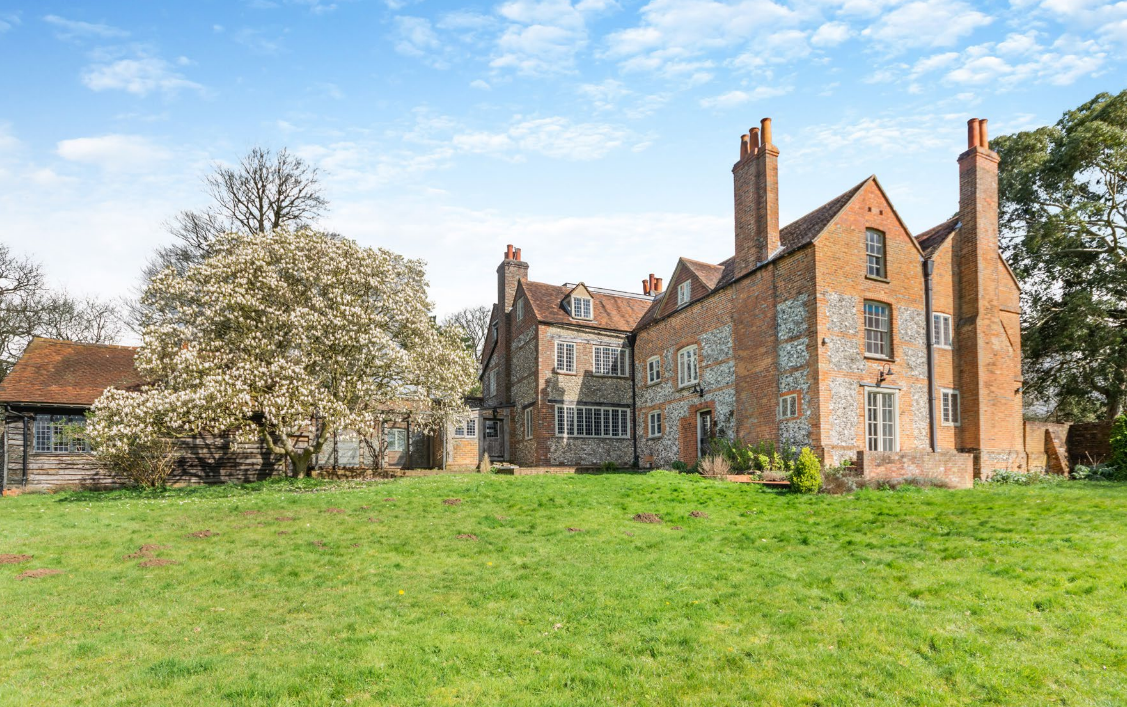
Coombe End Farm House, Goring Heath