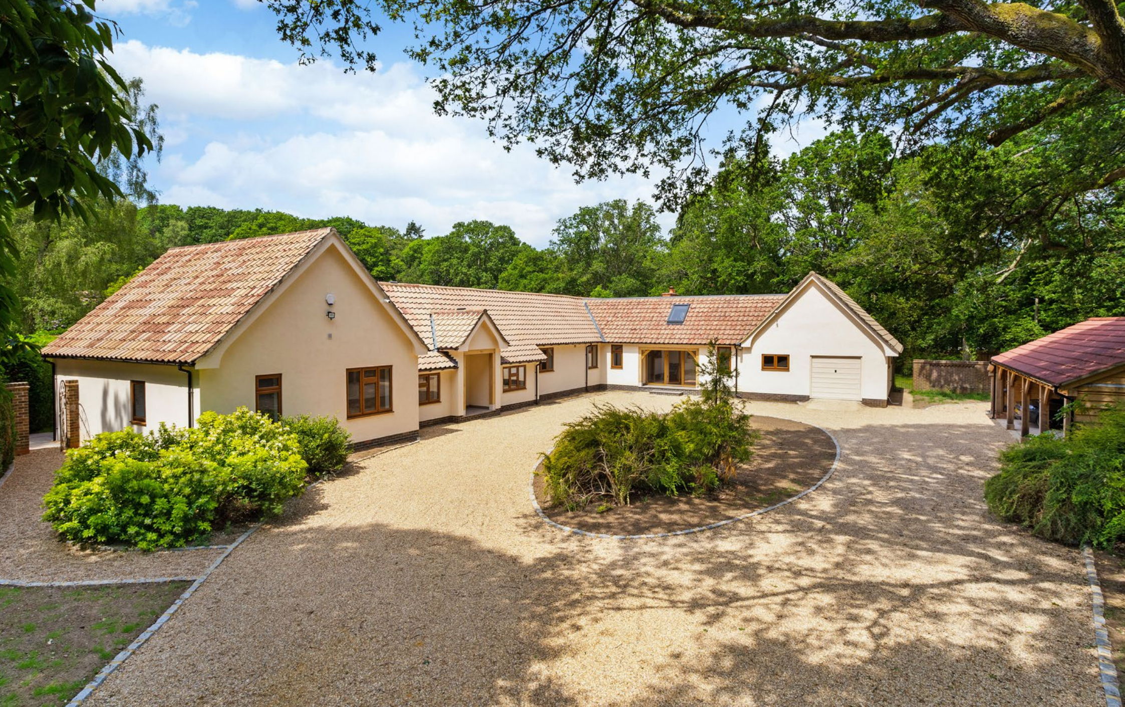
Hearn House, Spats Lane, Nr Churt, Hampshire