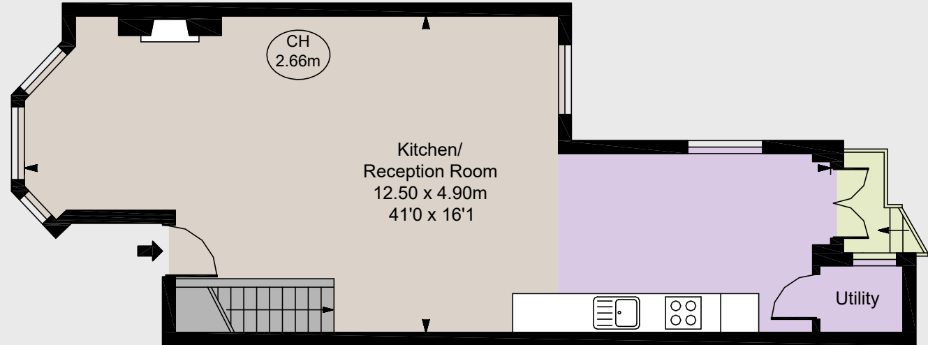
Raised Ground Floor Approximate Gross Internal Area 48.12 sq m / 561 sq ft