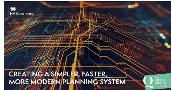
HM Government, 2021