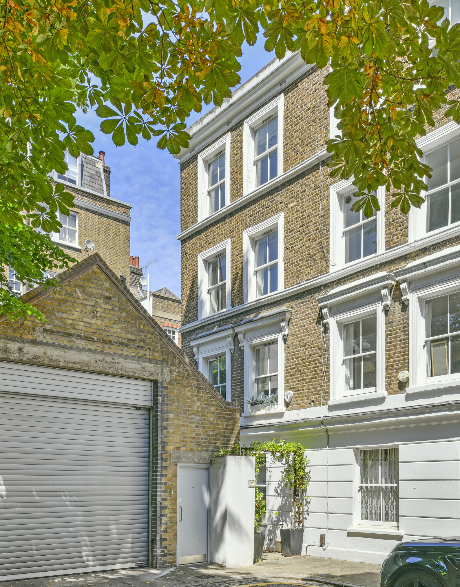
27 Ans dell Terrace, Kensington, W8