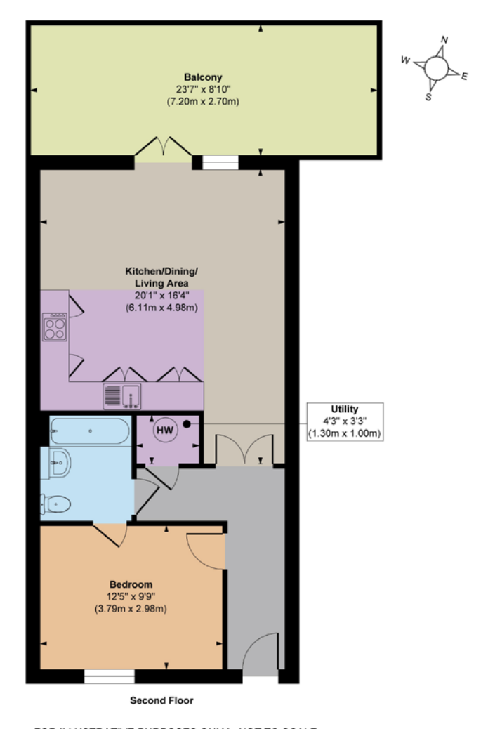
FOR ILLUSTRATIVE PURPOSES ONLY - NOT TO SCALE The position and size of doors, windows, appliances and other features are approximate only