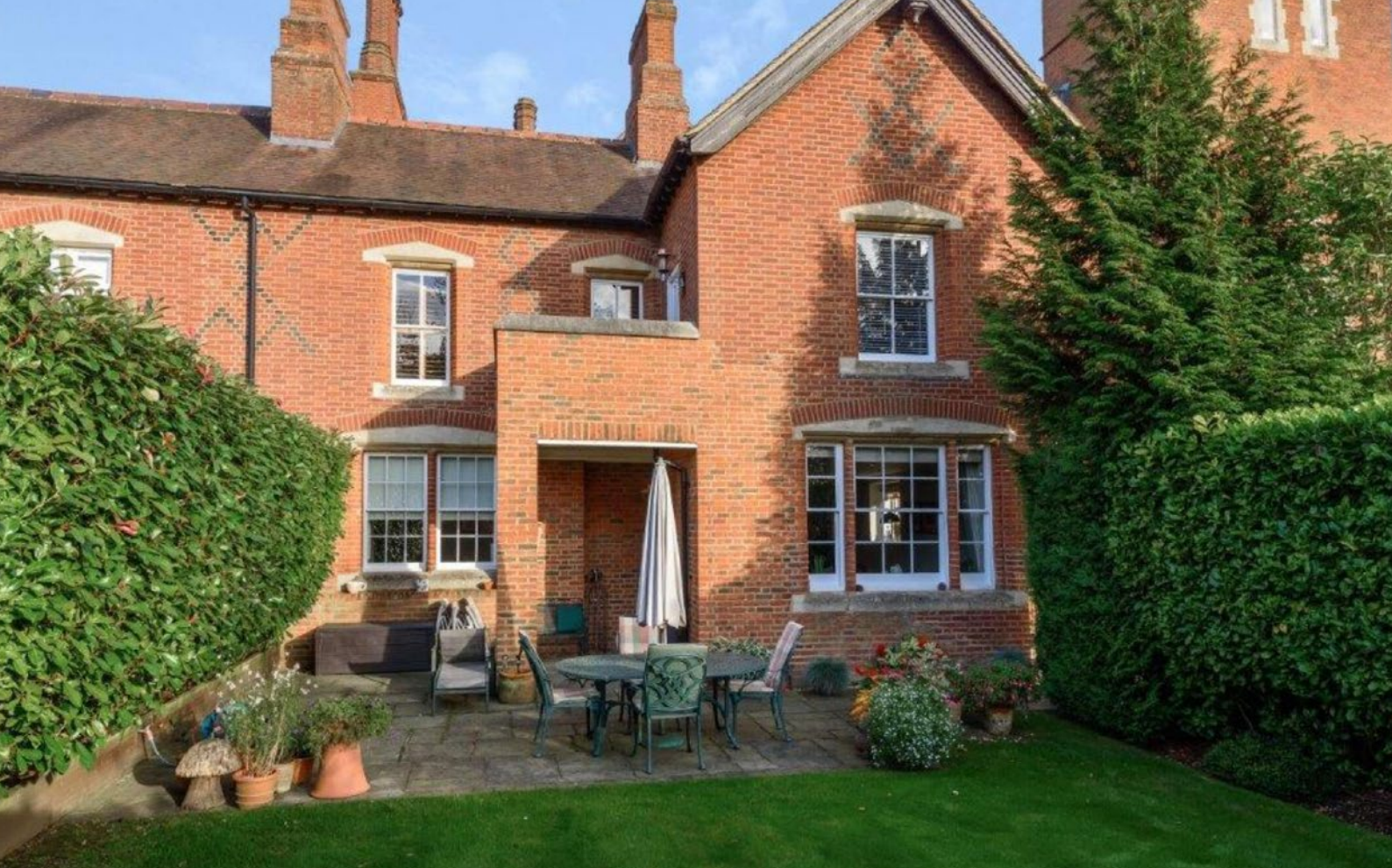
Bedwell Hall, Bedwell Park, Essendon, Hertfordshire