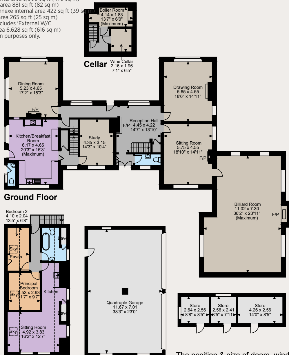
Coach House Annexe