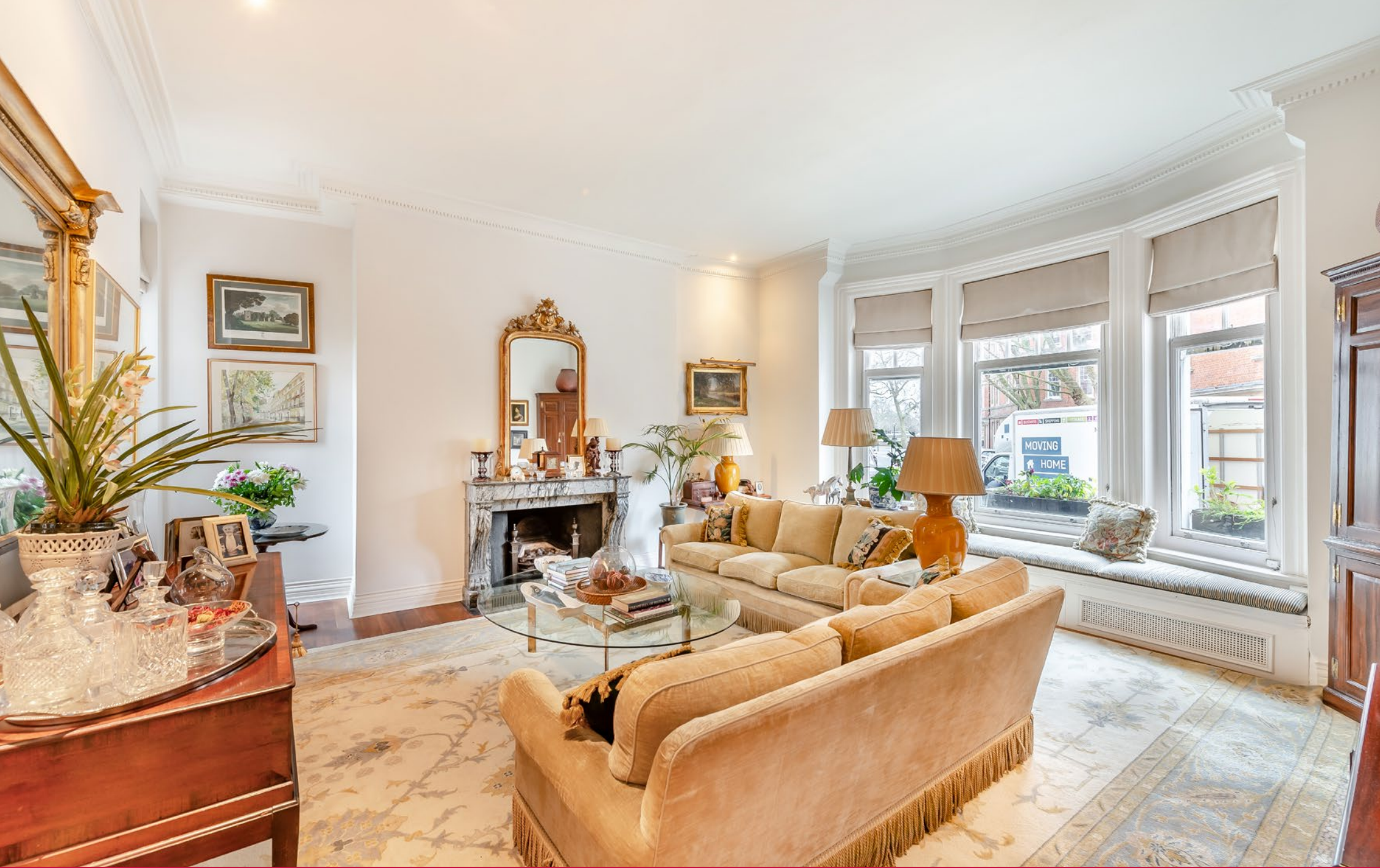
Chelwood House, Chelsea SW3