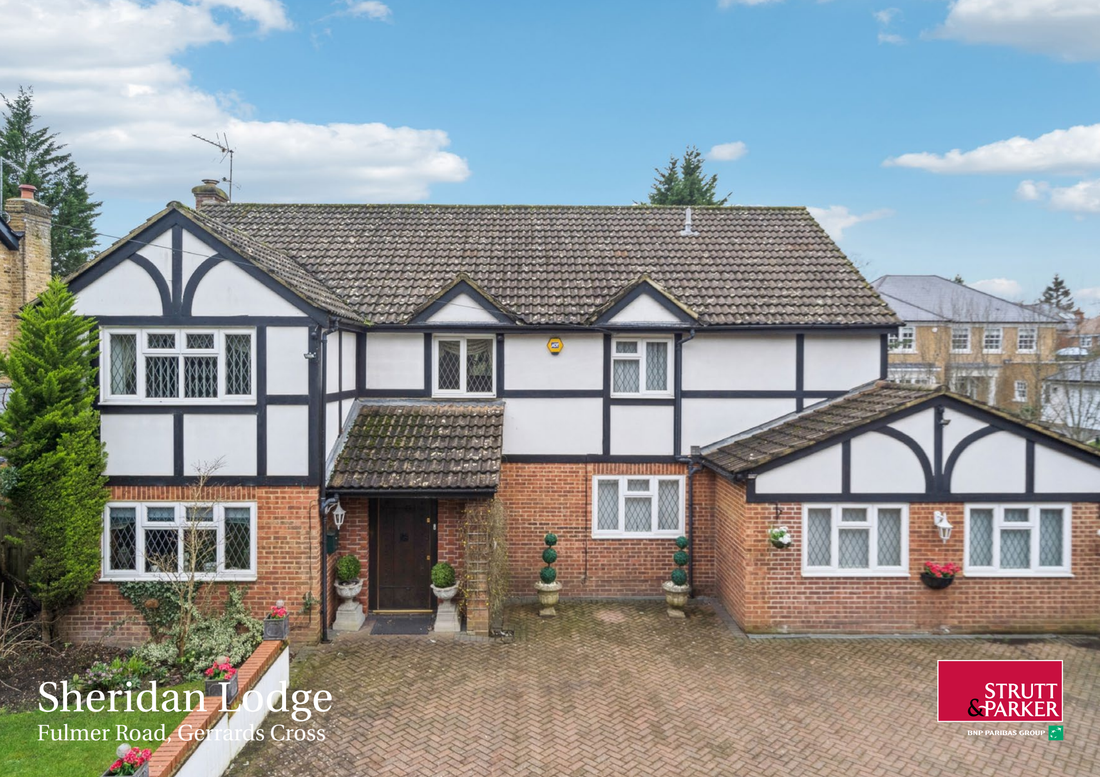
Sheridan Lodge Fulmer Road, Gerrards Cross