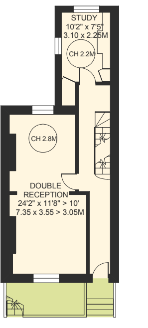
GROUND FLOOR 482 SQ.FT.