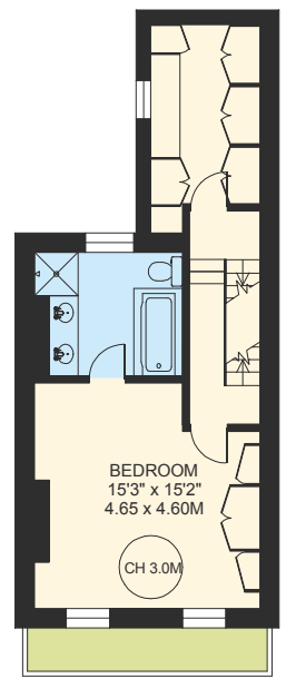
FIRST FLOOR 482 SQ.FT.