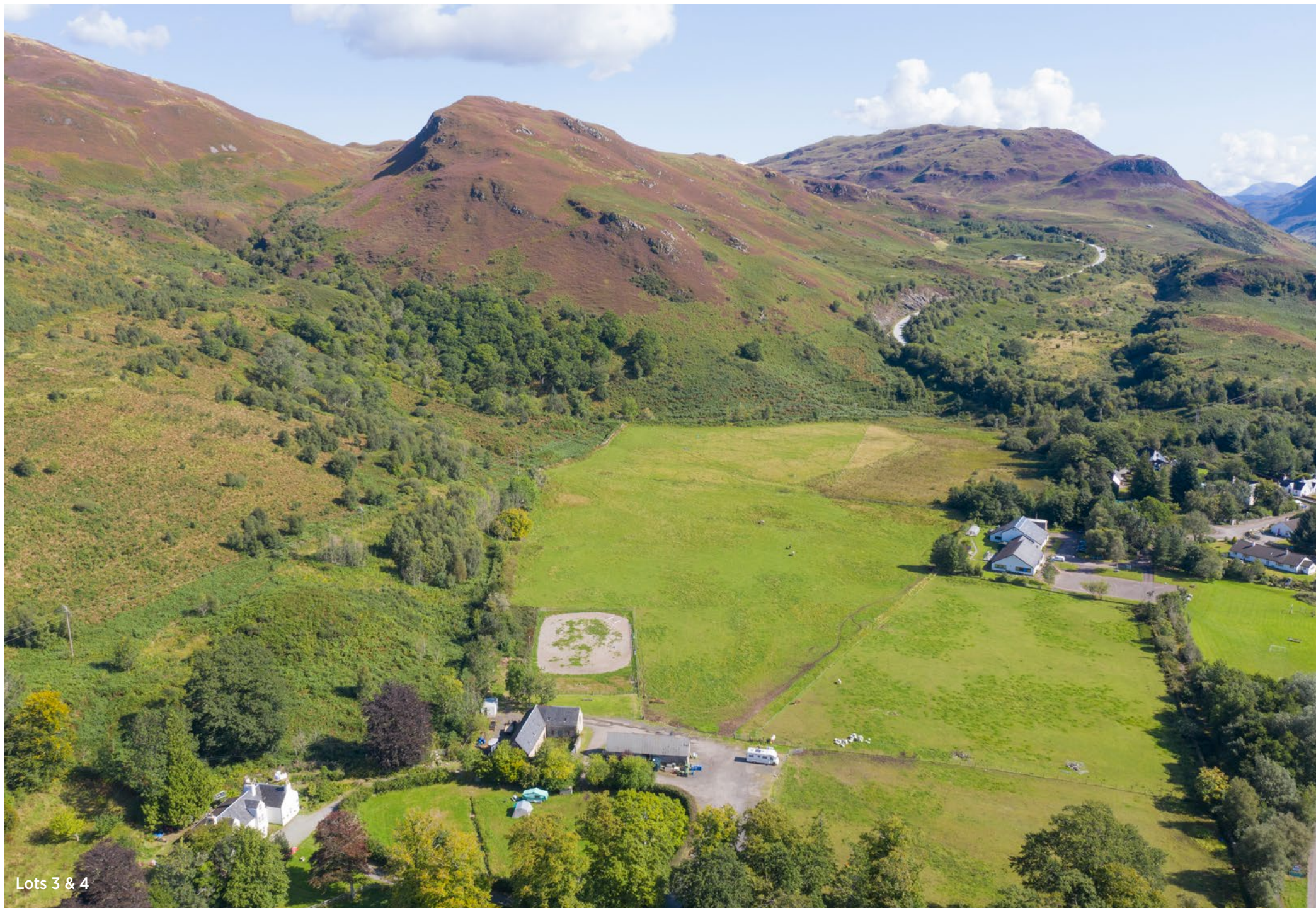
Lots 3 & 4