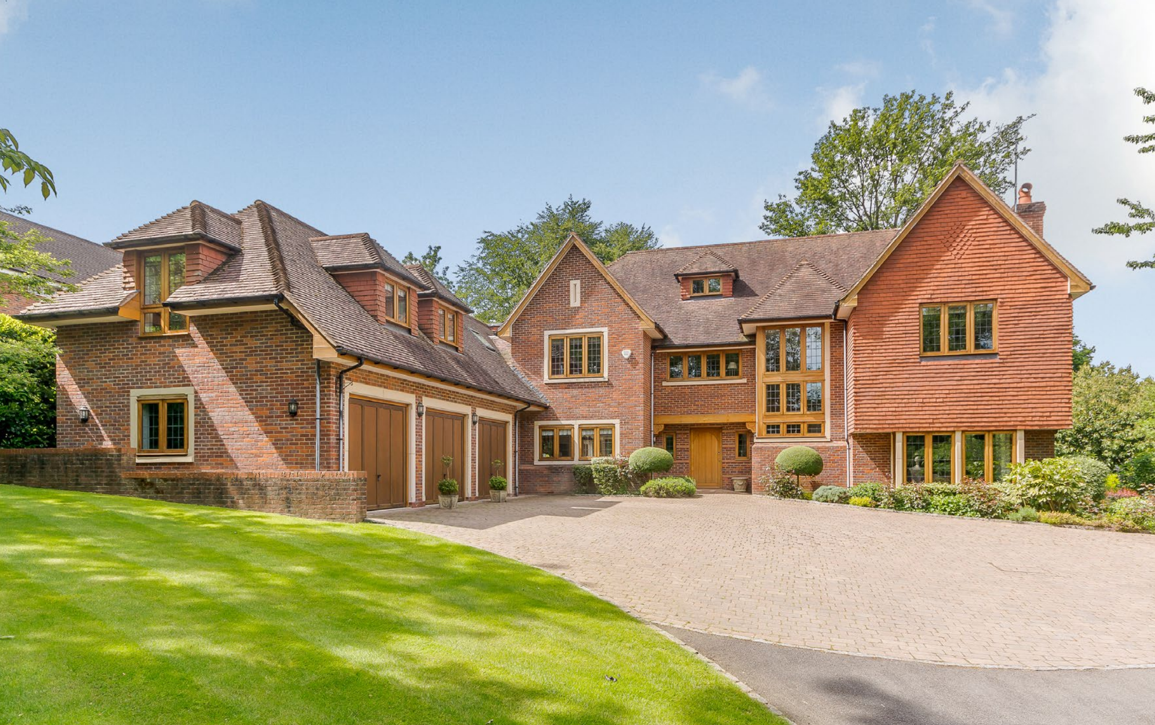
Grovebury House, Mill Lane, Chalfont St Giles, Buckinghamshire