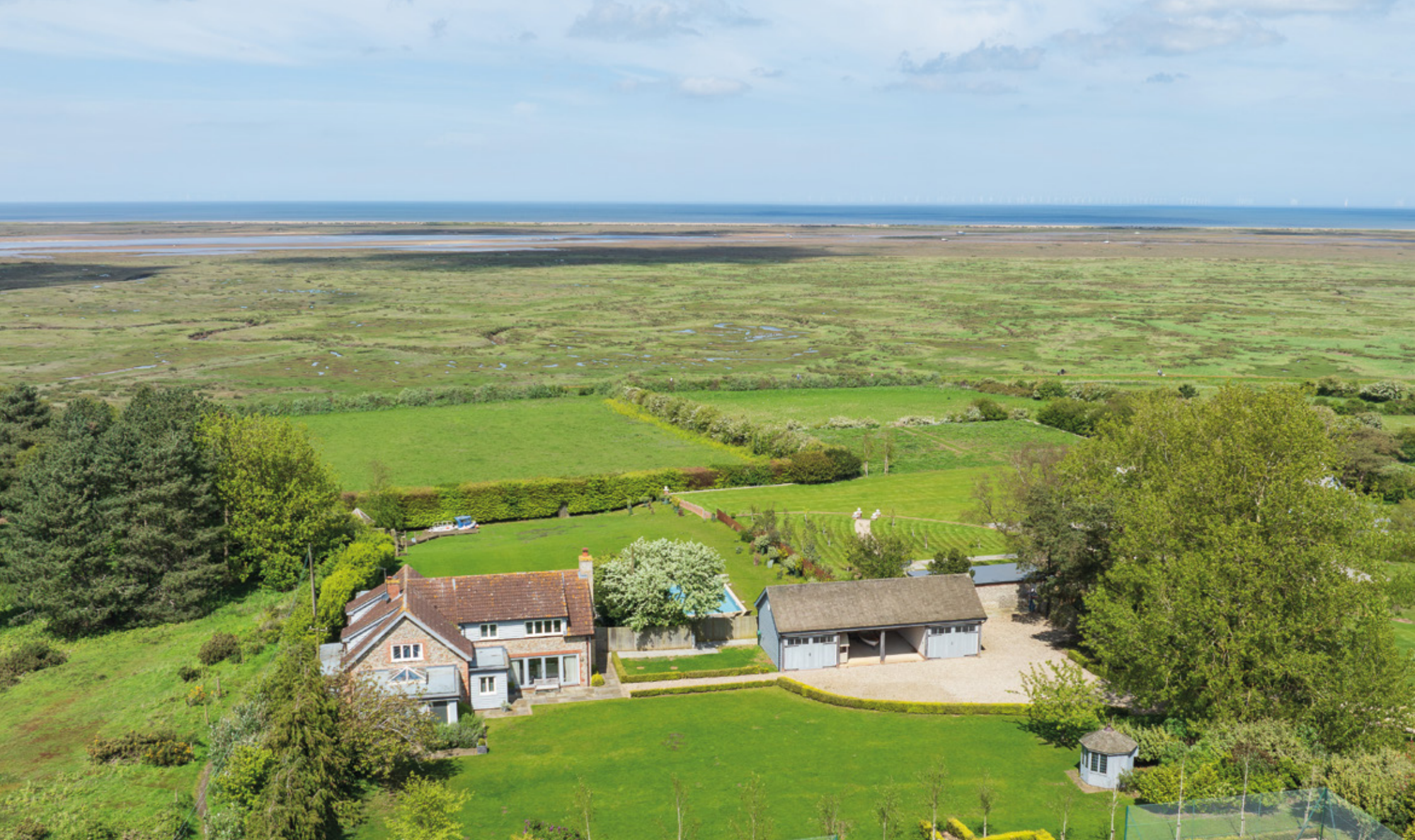
Lark Cottage, Blakeney, North Norfolk