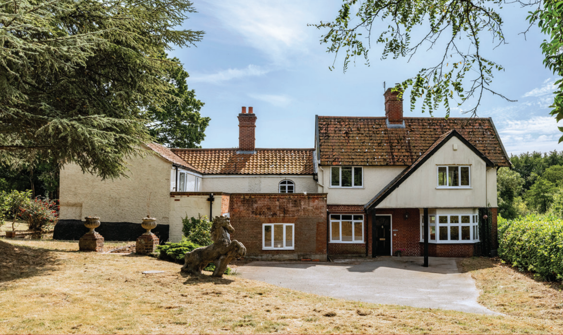
Burgate Hill House, Hainford, Norfolk