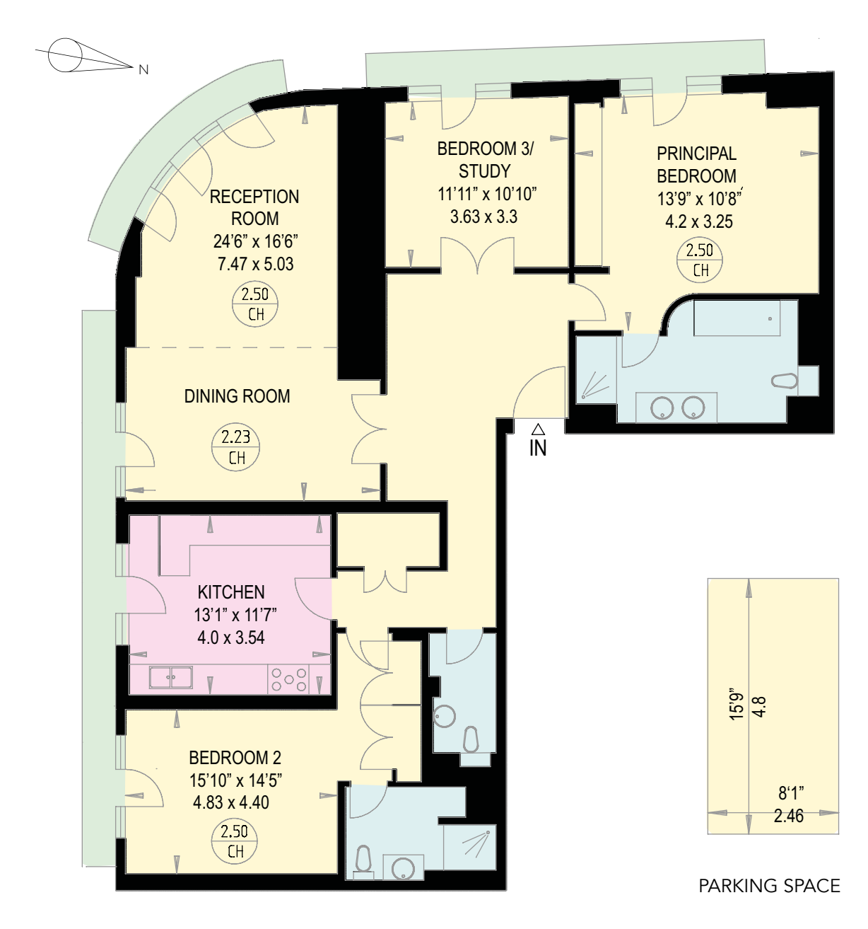
Illustration For Identification Only. Not to Scale. All Calculations Include Any/All Areas Under 1.5m Head Height

TENURE Leasehold: Lease expires 1st December 2150, therefore having approximately 127 years remaining GROUND RENT Approximately £1,250 per annum SERVICE CHARGE Approximately £22,528.76 per annum EPC RATING C LOCAL AUTHORITY Westminster City Council GUIDE PRICE £4,750,000