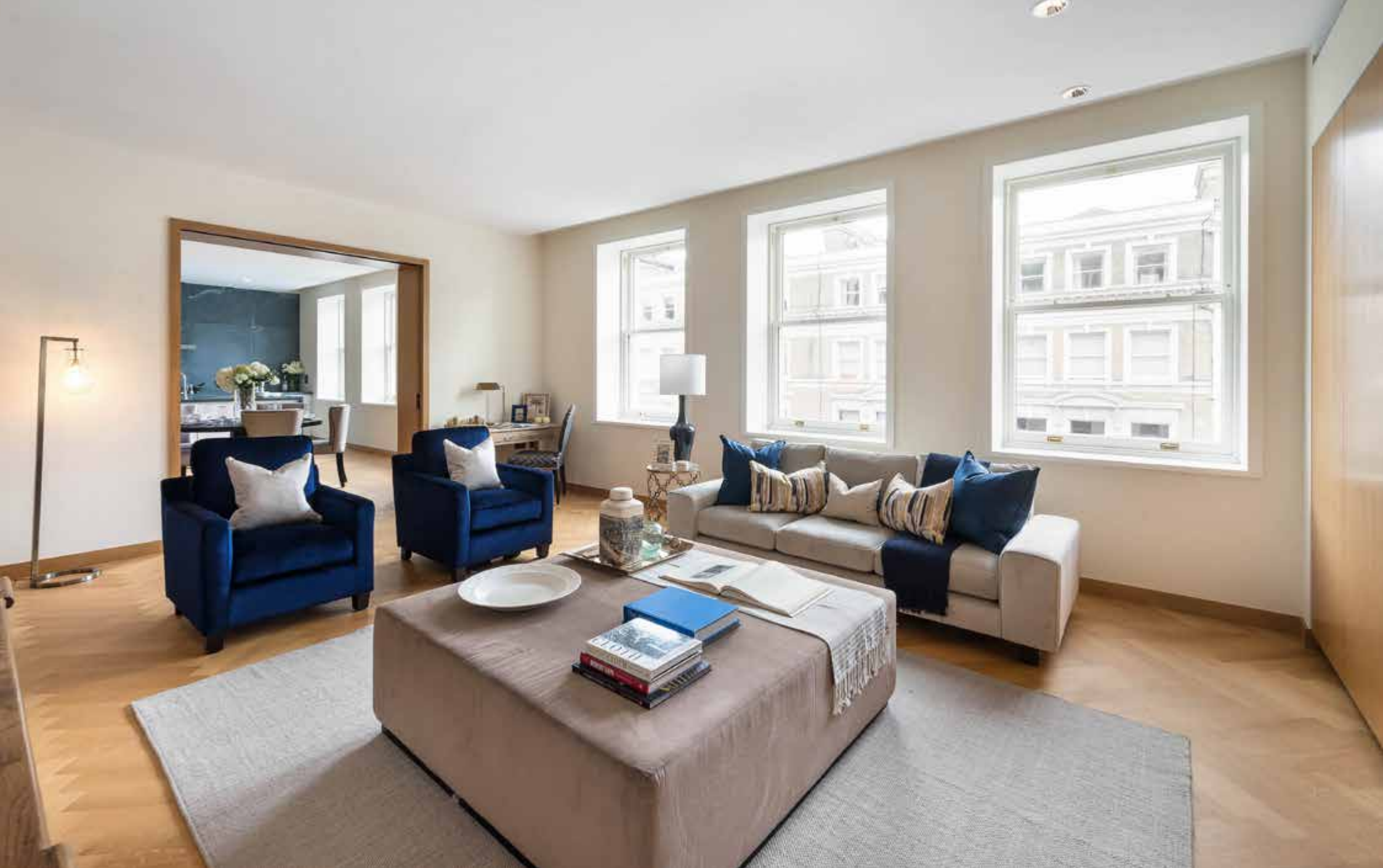
Apartment 70, One Kensington Gardens, Kensington, W8