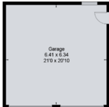
(Not Shown In Actual Location / Orientation)