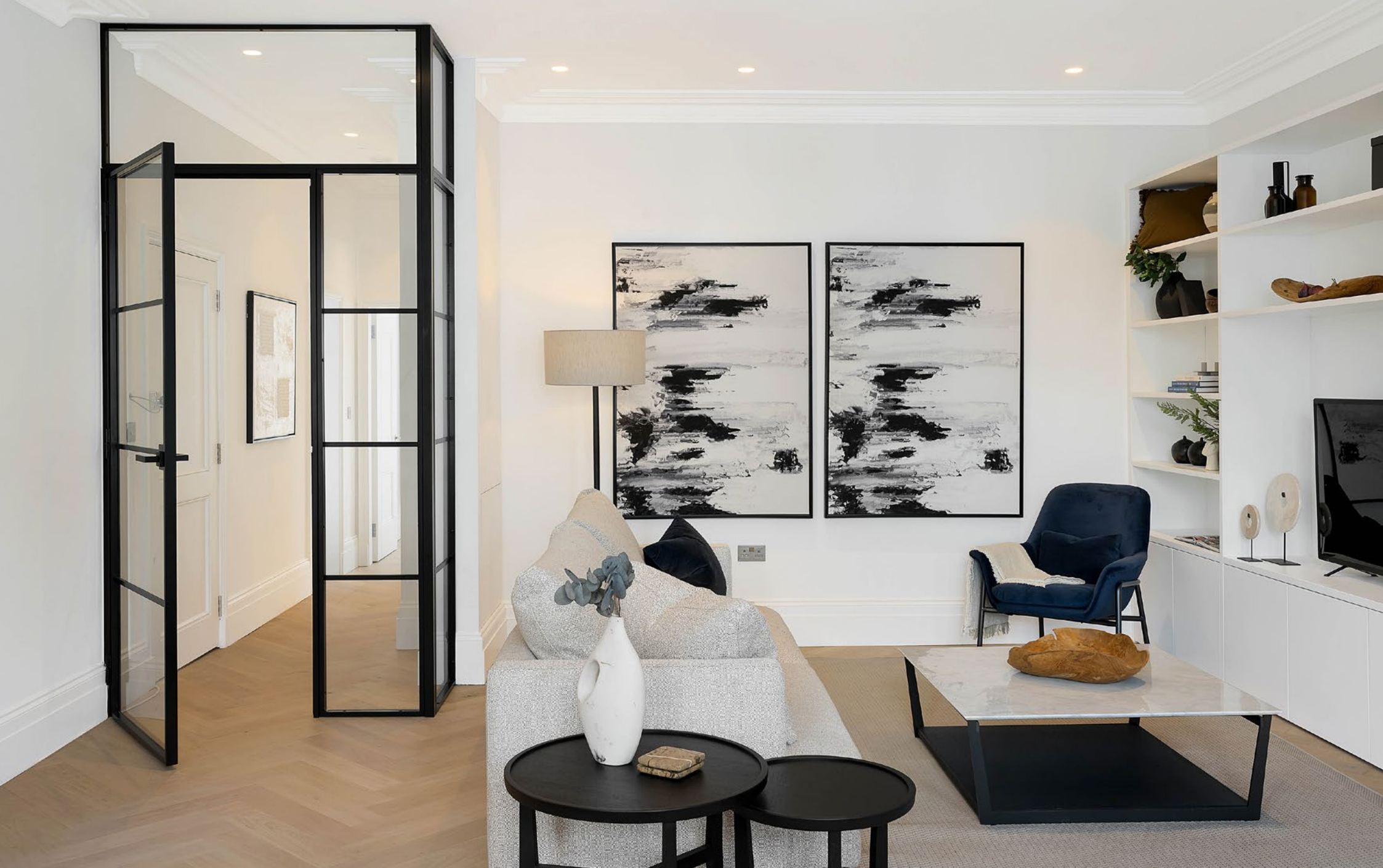
'The Redcliffe', Redcliffe Gardens, Chelsea