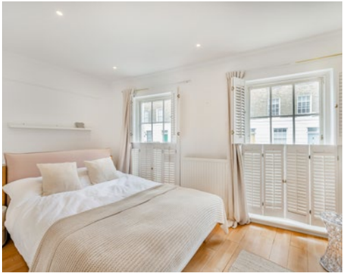
Flat B, 10-11 Rheidol Terrace, London N1