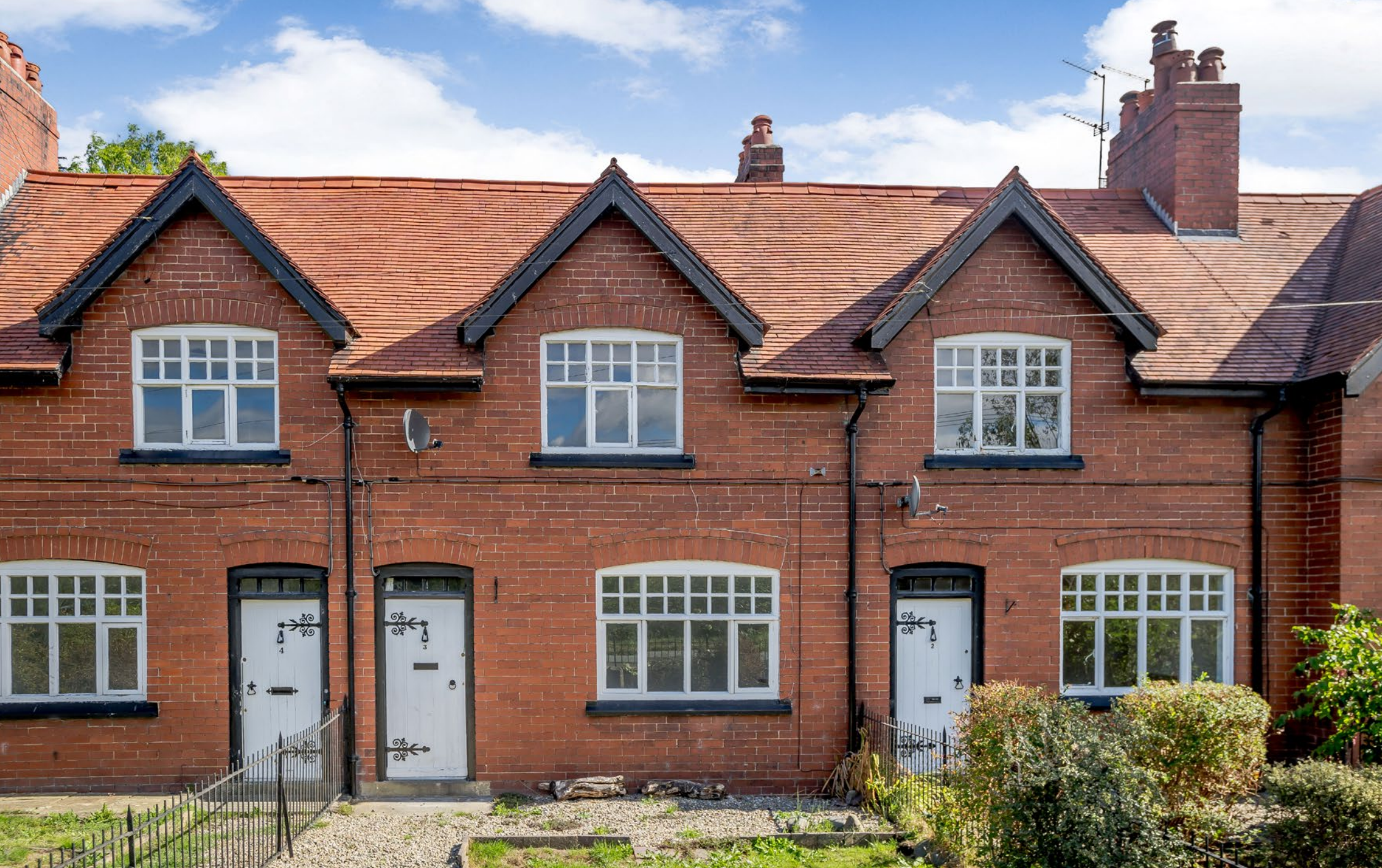
3 Red Houses, Rhyd Y Goleu, Rhosesmor