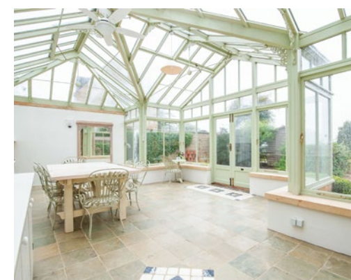
Slade Cottage, Sezincote, Moreton-in-Marsh, Gloucestershire