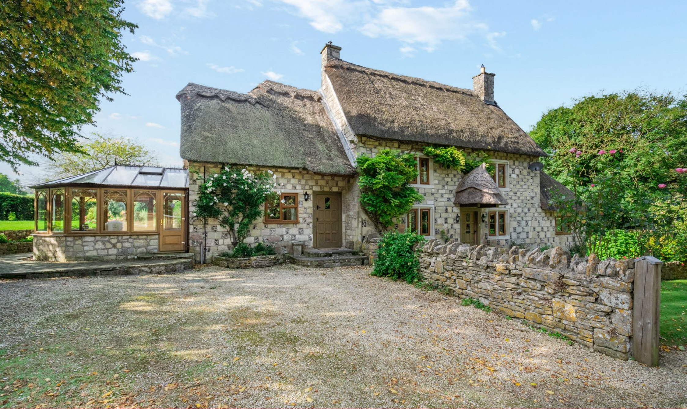
Sheepfold Cottage, 12 Sherrington, Warminster, Wiltshire