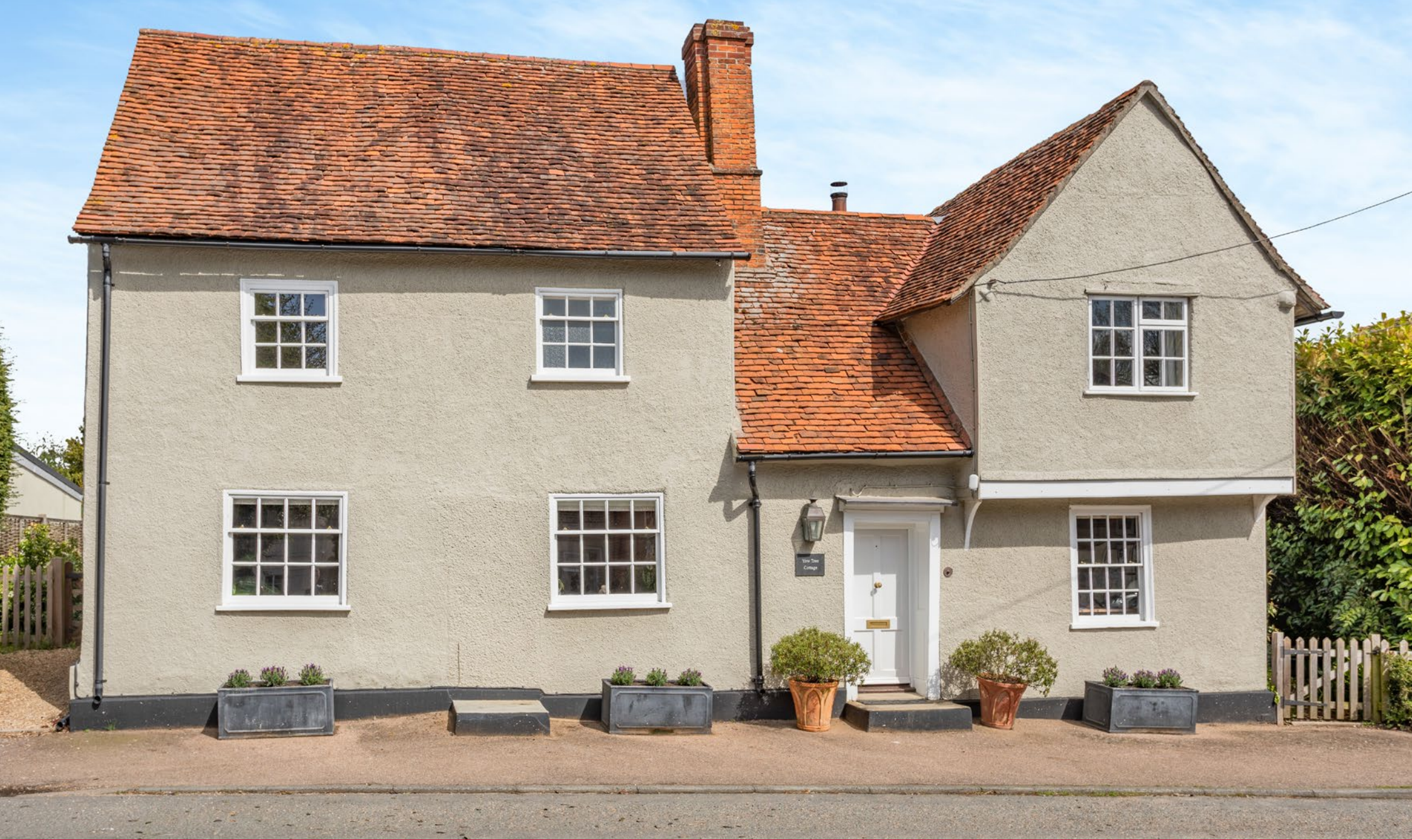
Yew Tree Cottage, The Street, Messing, Essex