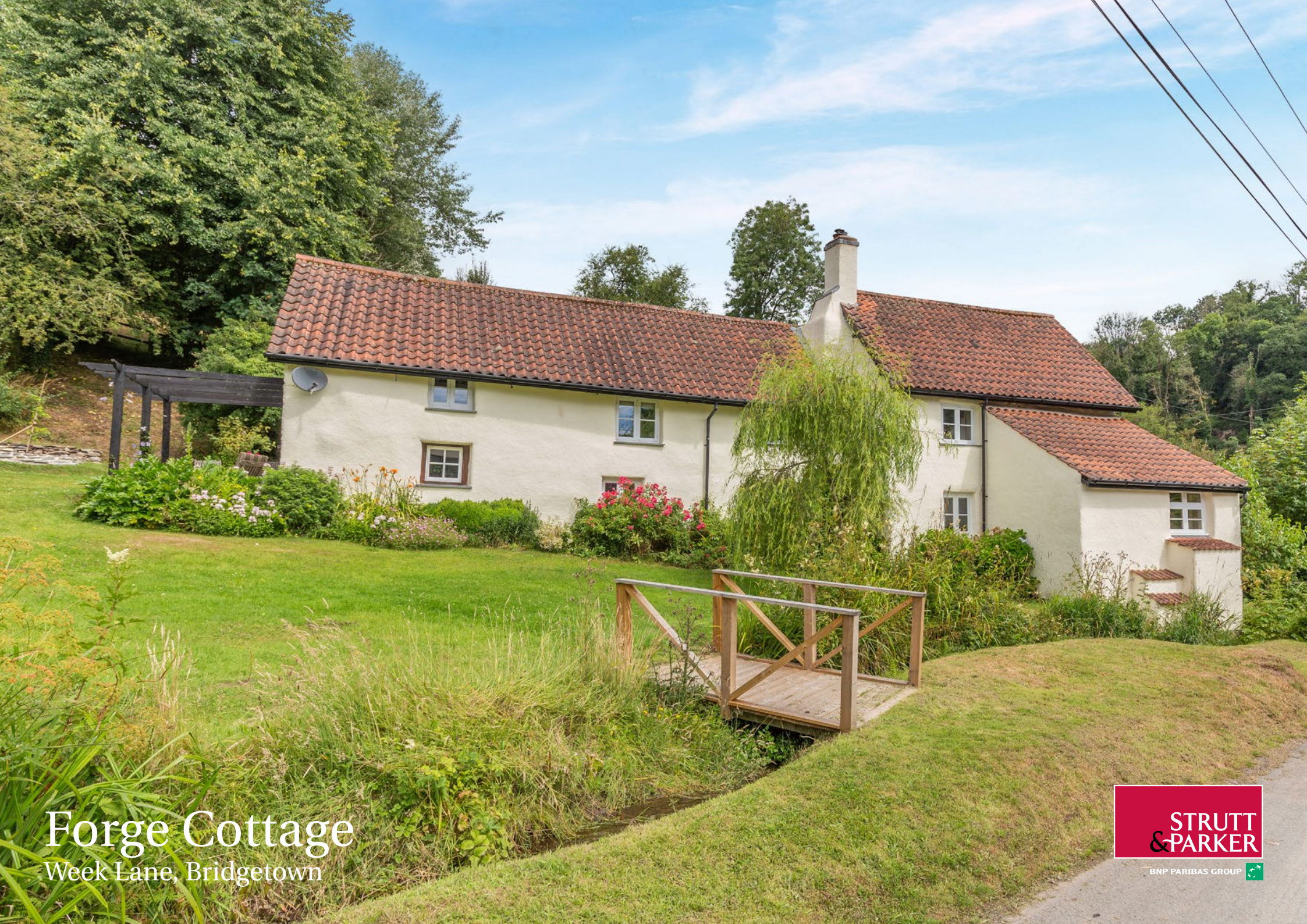
Forge Cottage Week Lane, Bridgetown