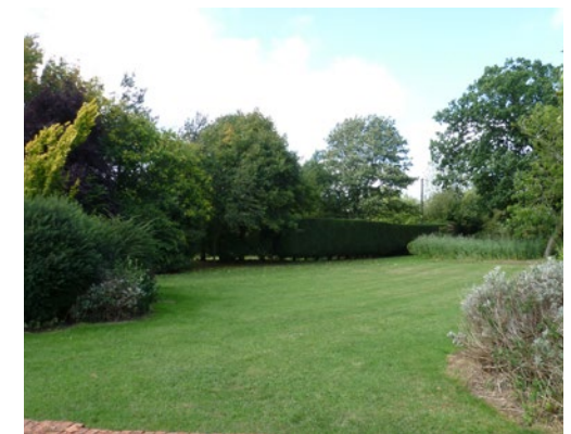
The Old Barn, Welsh Lane, Falcutt, Brackley, Northamptonshire