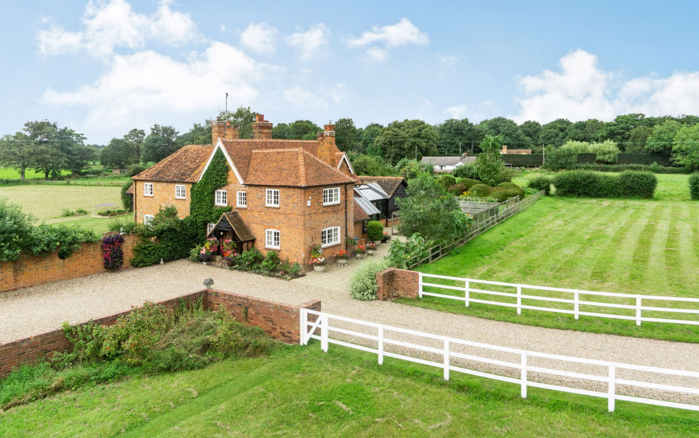
Yates Farm, Westley Mill, Binfield, Berkshire